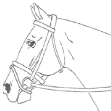
4) Flash noseband