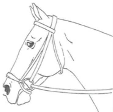
3) Dropped noseband